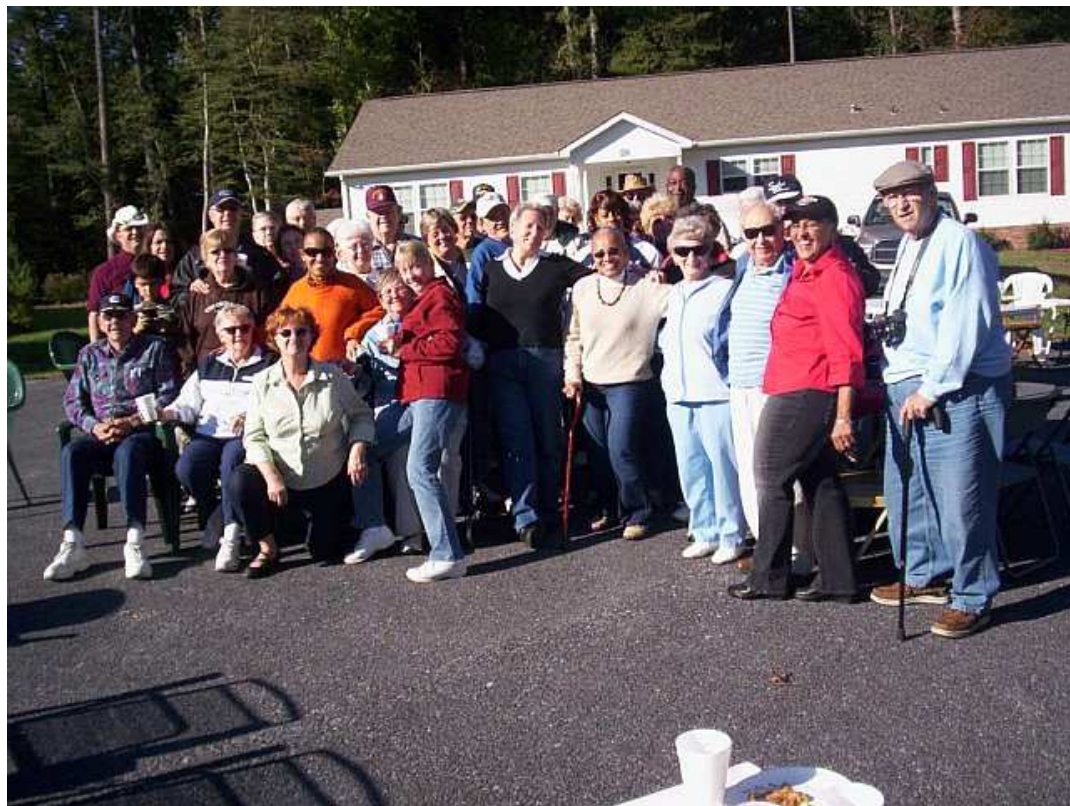
Residents getting to know each other!