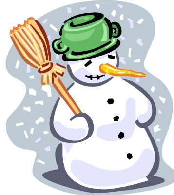
Please help the needy stay warm in the cold months, have full bellies and new toys to play with.

are also asking all residents, friends and family members to clean out your closets and dressers with any winter coats, mittens and gloves you may have to donate to the less fortunate who cannot afford to stay warm this winter. If we all do a little it will add up to a lot.